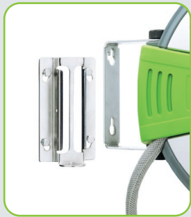
robust metal mount with insert rail