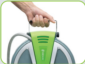
removable and portable