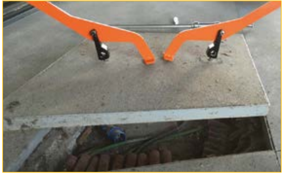
Opening larger lid can be done with two LB2.