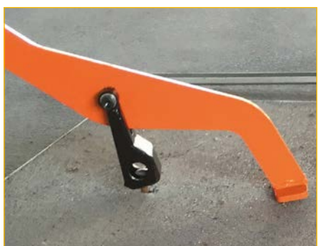
Possibility to custom hooks according t specifications if needed.