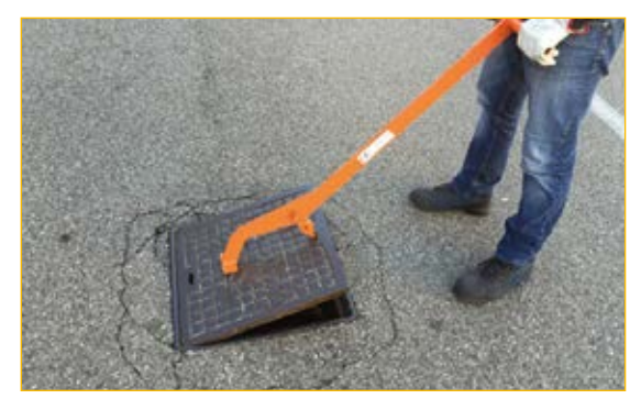
In the opening operation, the length of the lever limits the operator effort.