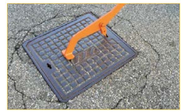
Inserting the hook into the slot and rotate to 90°.

Practical lever lifter for lids with latches or in the absence of cast iron surface. For the correct connection the lower hook is inserted into the slots on the cover and the lever is turned through 90°.