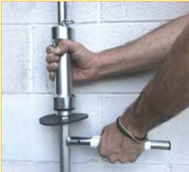
Safety pin when hammer is not in use.

Practical and versatile percussive tool designed to facilitate the opening of manhole covers blocked by rust, ice, stones, asphalt, temperature expansion and inactivity.