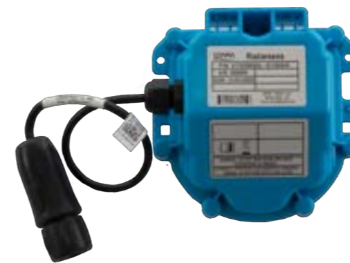
RadarSens Radar Level Sensor

RadarSens is our cost-effective and easy-to-install level monitoring system that uses radar sensing technology to effectively monitor level in waste water networks. Intrinsically safe and compatible with our range of HWM data loggers, RadarSens includes a variety of different deployment features to ensure a quick and 'right first time' deployment.