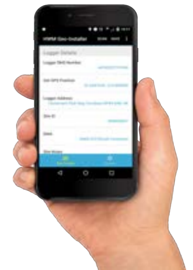
Deployment App Installation Support