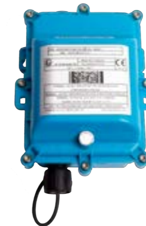
IS Log ATEX Certified Data Logger